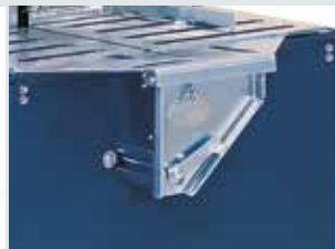
[ 3 ] Additional table