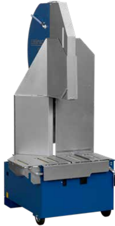
DTS 420 PE/N