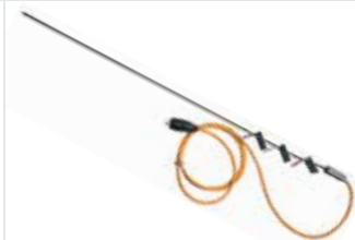
[ 2 ] Rod heater