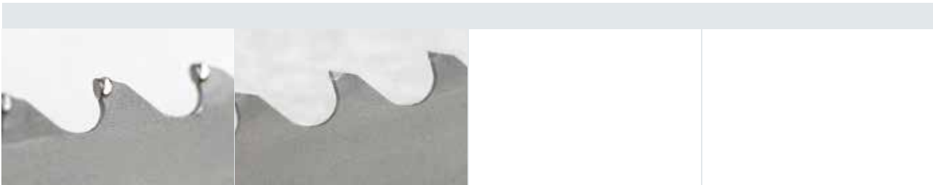
Saw belt rounded